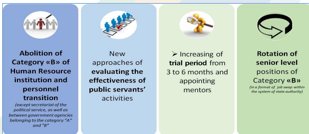
Figure 5: Current reforms in the Republic of Kazakhstan